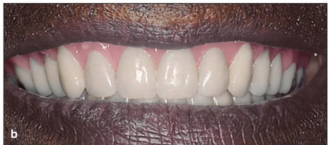
Fig 1-2 (a) Complete maxillary and mandibular wax trial dentures with denture teeth of an appropriate mold (ie, size and shape) and shade. (b) Note how the high value of the pink baseplate wax strongly suggests the need for custom characterization of the denture base resin so the dentures are less obvious. (c) The appearance of the definitive maxillary and mandibular complete dentures, following custom characterization of the denture base resin, illustrates the possibility of maximum control over materials and techniques.