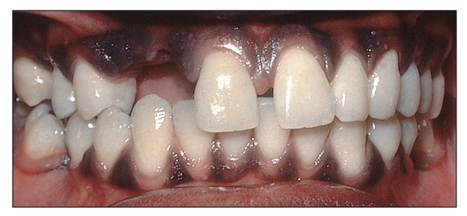
Fig 1-4a Preoperative appearance of a patient missing the maxillary right canine and lateral incisor.