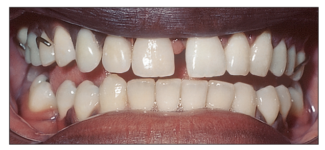
Fig 1-4b Postoperative appearance of the same patient with a characterized transitional partial denture replacing the maxillary right canine and lateral incisor.