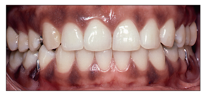
Fig 1-5a The mandibular bilateral distal removable partial denture (Kennedy Class I) was designed to minimize the display of the metal retentive clasps by using infrabulge clasps. Denture teeth had to be selected of an appropriate shade and mold to blend with the surrounding natural teeth.